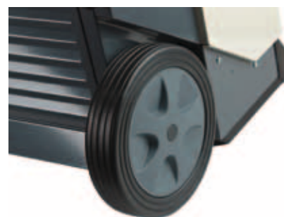
Big rubber wheels ensure safe and easy manoeuvring.

Adjustable and fixed handles ensure safe and convenient handling and operation. Big rubber wheels make the CDT's easy to move both up and down stairs and across seemingly impassable areas. The wheels are in line with the sides of the unit to make it as narrow as possible and to protect doors and panels from unnecessary knocks. During transport and storing the CDT units can be stacked requiring as little space as possible.