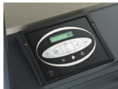
Digital display with integrated humidity control, energy counter, service status and easy fault finding allows optimal dehumidification.