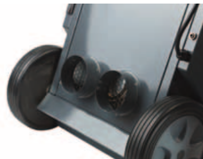
CDT 30 S and CDT 40 S are fitted with a 1 kW heating element and a high pressure fan allowing connection of two flexible air ducts Ø100, each up to 5 m long.

The CDT range offers capacities from 30 to 94 l/24 h and a maximum working temperature of 32° C, as well as superior control of settings and operations. The digital finger touch display puts you in quick and easy control of humidity and service status. Furthermore, hours and energy consumption can be read off the display.