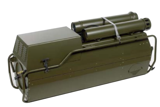
VAM 15 MK II mobile heating unit