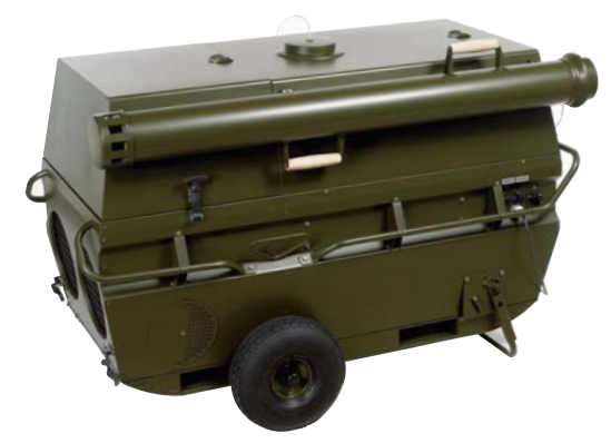
VAM 40 MK II mobile heating unit